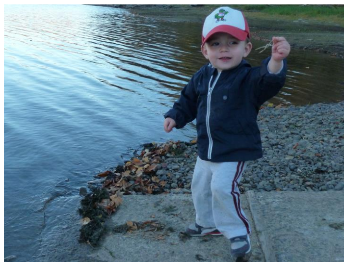
Spring is almost here!

94 Sanctuary Rd, Lake Ariel, Pennsylvania 18436